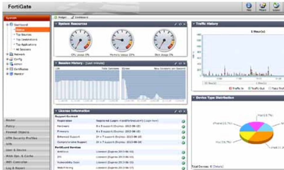
FortiOS Dashboard — Single Pane of Glass Management

Fortinet FortiGuard Subscription Services provide automated, real-time, up-to-date protection against the latest security threats. Our threat research labs are located worldwide, providing 24x7 updates when you most need it.